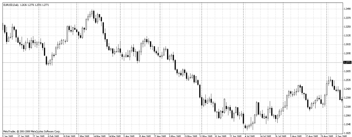
Fig. 3. The daily chart of EUR/USD quotes in 2005

However, the comparison of the same exchange instruments, in the year of 2005 gives a completely different picture (Figures 3 and 4) [3].