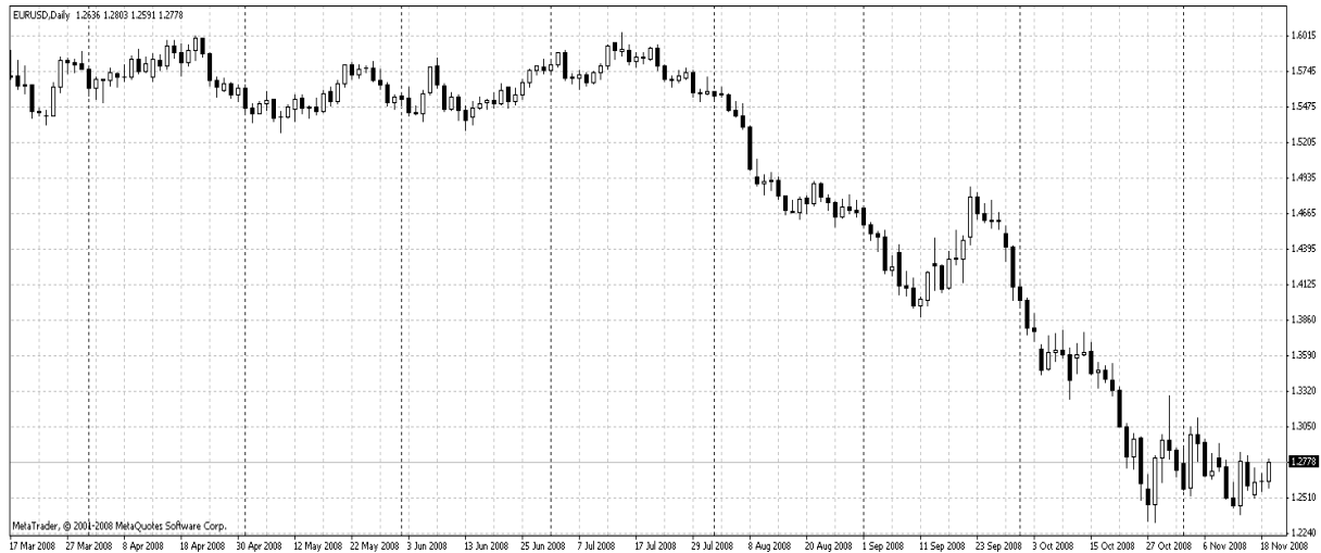
Fig. 1. The daily chart of EUR/USD quotes in 2008

year – on gold, 2 years later – on the stock market and so on. As a visual illustration of the proposed hypotheses, we will show the daily chart of oil and EUR/USD in 2008 (Figures 1 and 2) [3].