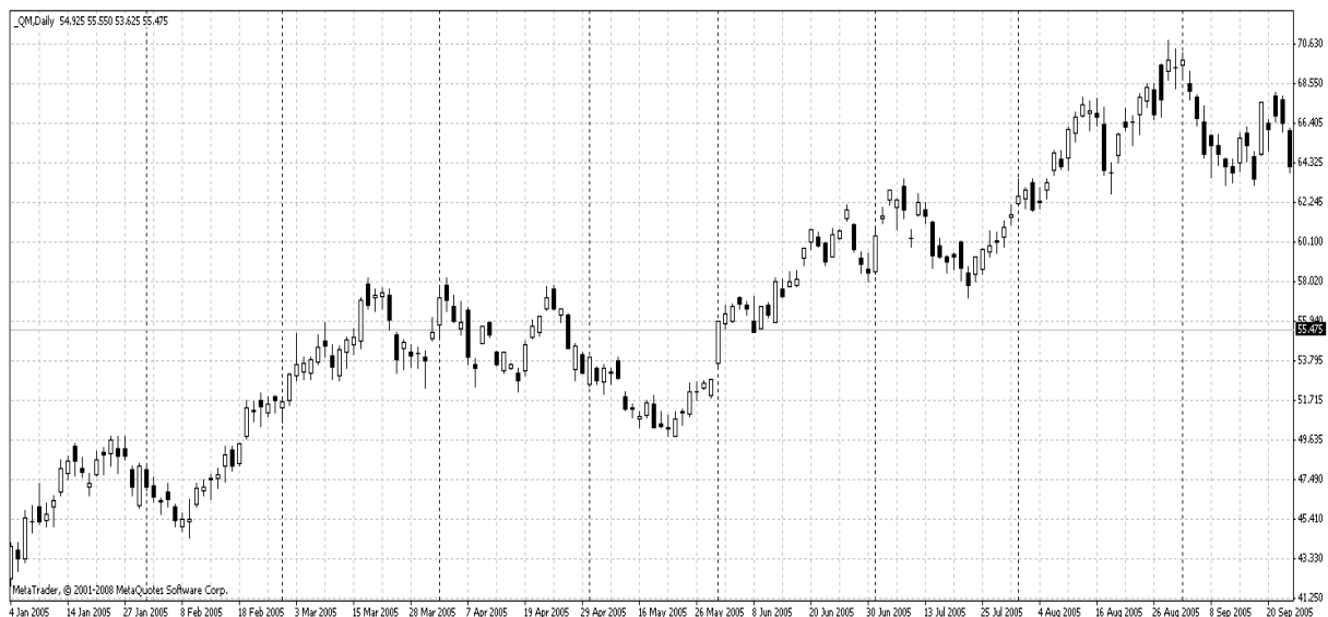
Fig. 4. The daily chart of prices for oil in 2005

As we see, the focuses of the market are not constant and shift from time to time. As an analysis tool we will use the pair correlation analysis, because it is better and more objective than a simple comparison of two charts of instruments, and allows to appraise in figures this “focus” of the market, figuratively speaking – the force of market’s concentration on something.