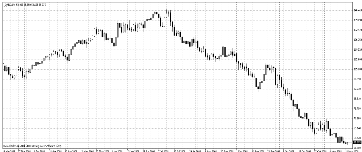
Fig. 2. The daily chart of prices for oil in 2008

As we can see, the charts are almost identical, though the exchange instruments we analyzed are very different – currency pair and the commodity asset – oil.